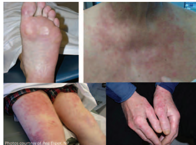
Figure 2 Hand and foot syndrome reaction.

In another systematic review and a meta-analysis to determine risk for HFSR among patients receiving sunitinib, the summary incidences of all-grade and high-grade HFSR were 18.9% (95% CI, 14.1%–24.8%) and 5.5% (95% CI, 3.9%–7.9%), respectively. In addition, patients receiving sunitinib had a significantly increased risk of all-grade HFSR (RR, 9.86; 95% CI, 3.1–31.31; P < .001 ) compared with controls. 120 By contrast with sorafenib, 119 patients with RCC receiving sunitinib had significantly decreased risk of HFSR compared with patients with a non-RCC malignancy (RR, 0.56; 95% CI, 0.50–0.64; P < .001 ). 120 The pathogenesis for HFSR remains unknown. HFSR might result from the effect of mechanical pressure to palms and soles. Alternatively, the sensitivity of palms and soles to several TKIs could be partly related to the increased number of eccrine sweat glands in the extremities. Several recep-