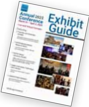
EXHIBIT DATES March 31–April 1, 2023

INSERTION ORDER DUE Friday, January 27, 2023