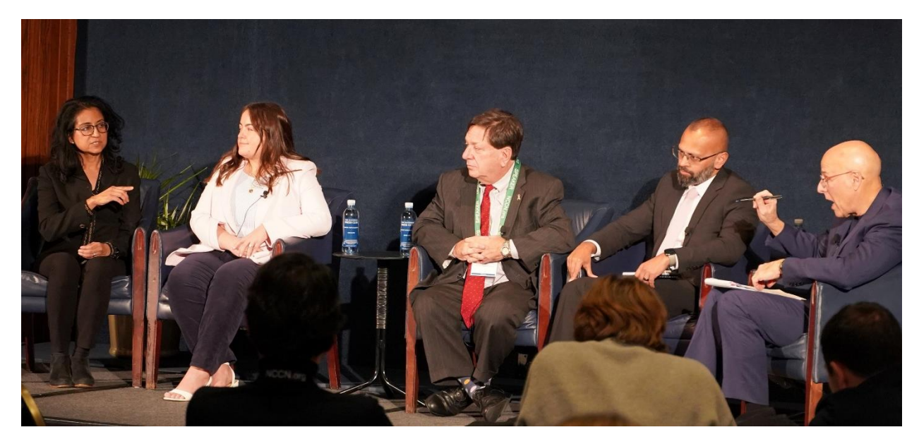
The December 2023 Patient Advocacy Summit featured an afternoon panel discussion about strategies to mitigate the economic burden on people facing cancer.