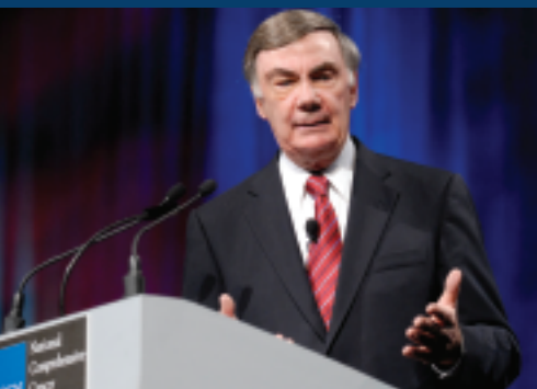
Sam Donaldson (Moderator) ABC News veteran and anchor Roundtable: e-Health – Educating, Enlightening, or Exasperating the American Patient with Cancer?