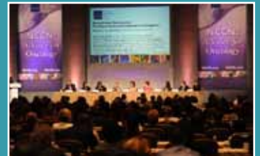
Exhibit Dates March 15 & 16, 2012