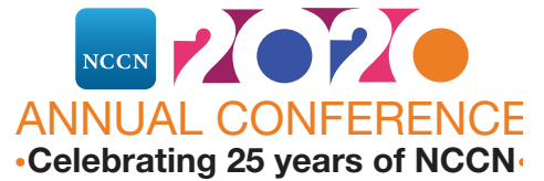
Exhibit Dates: March 20 – 21, 2020